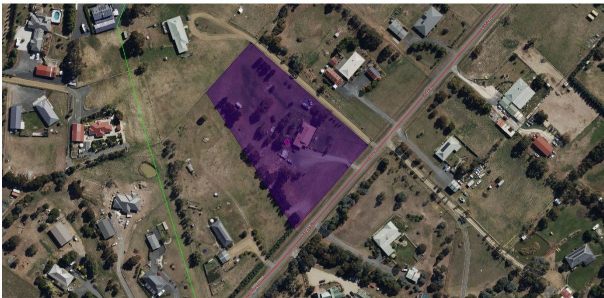
Fig 1 - Site Location.

Glen William Howlett has applied for an increase to their kennel licence from 8 dogs to 10 dogs on their property at 15 Linda Avenue, Pontville (CT 109172/34) (see Fig 1 below). This application is for 10 greyhounds. The property is 2.77 acres in size and is located within the Rural Living Zone under the Tasmanian Planning Scheme. Under the Policy, the guidance number of dogs for a block this size is 5–7.