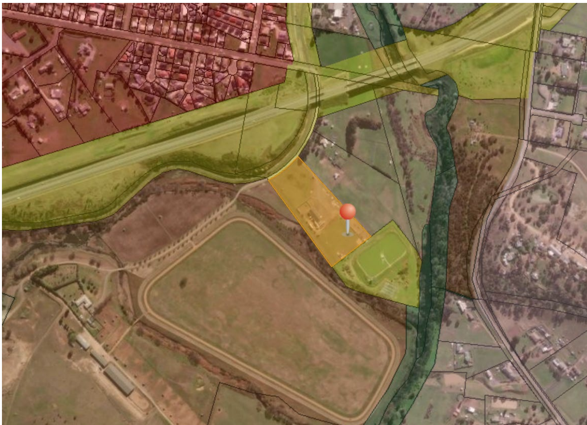
Figure 1 - Site Location.

Mr and Mrs Brazendale have applied for an increase to their kennel licence from 10 dogs to 19 dogs on their property at 147 William Street, Brighton (CT 252444/1) (see Fig 1 below). This application is for 18 greyhounds and 1 mixed breed companion dog. The property is 2.513 hectares in size and is located within the Rural Zone under the Tasmanian Planning Scheme. Under the Policy, the guidance number of dogs for a block this size is 5 – 7.