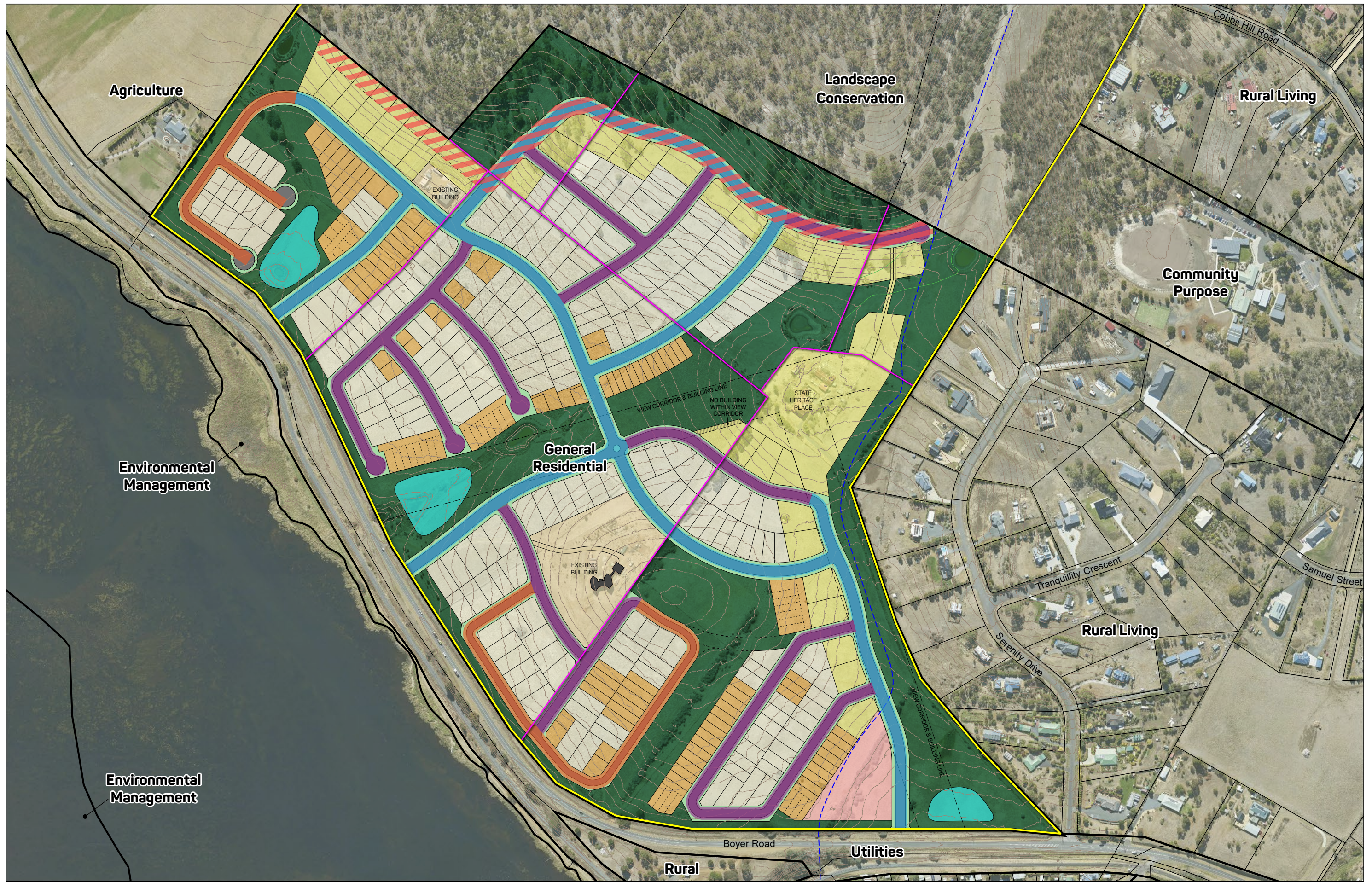
Fig BRI-S13.2 Development Framework