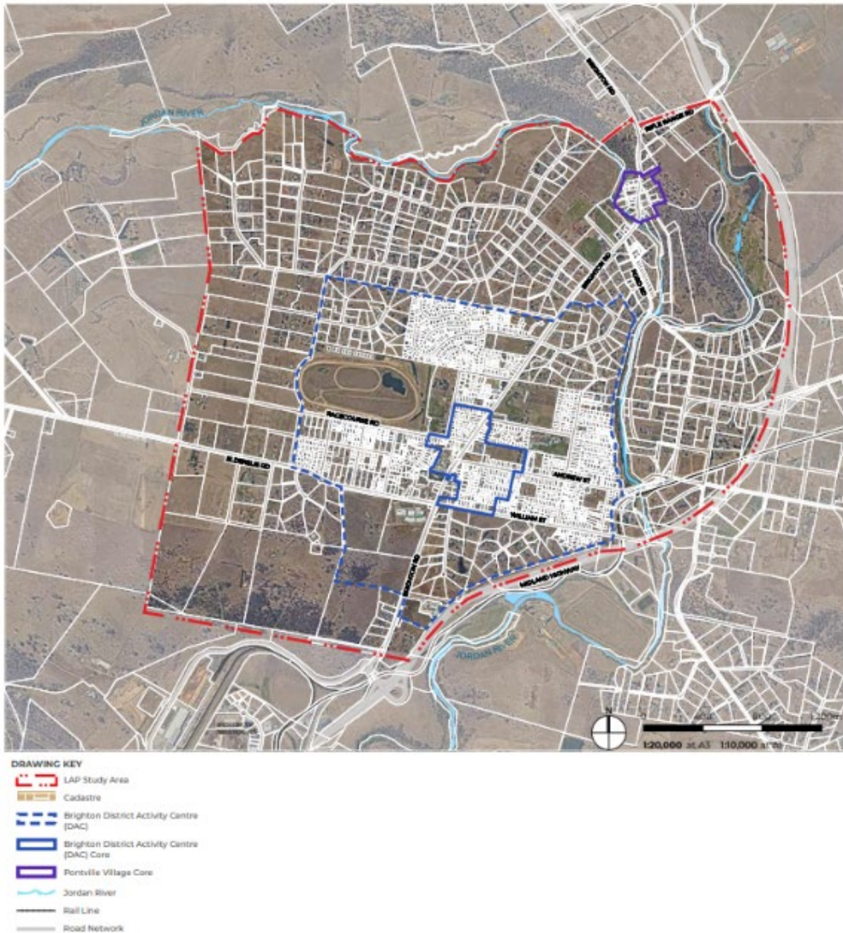
Figure 2 BLAP Study Area (Mesh)

The BLAP study area is shown in Figure 2 below. Note that the study area did not cover the entirety of both suburbs.