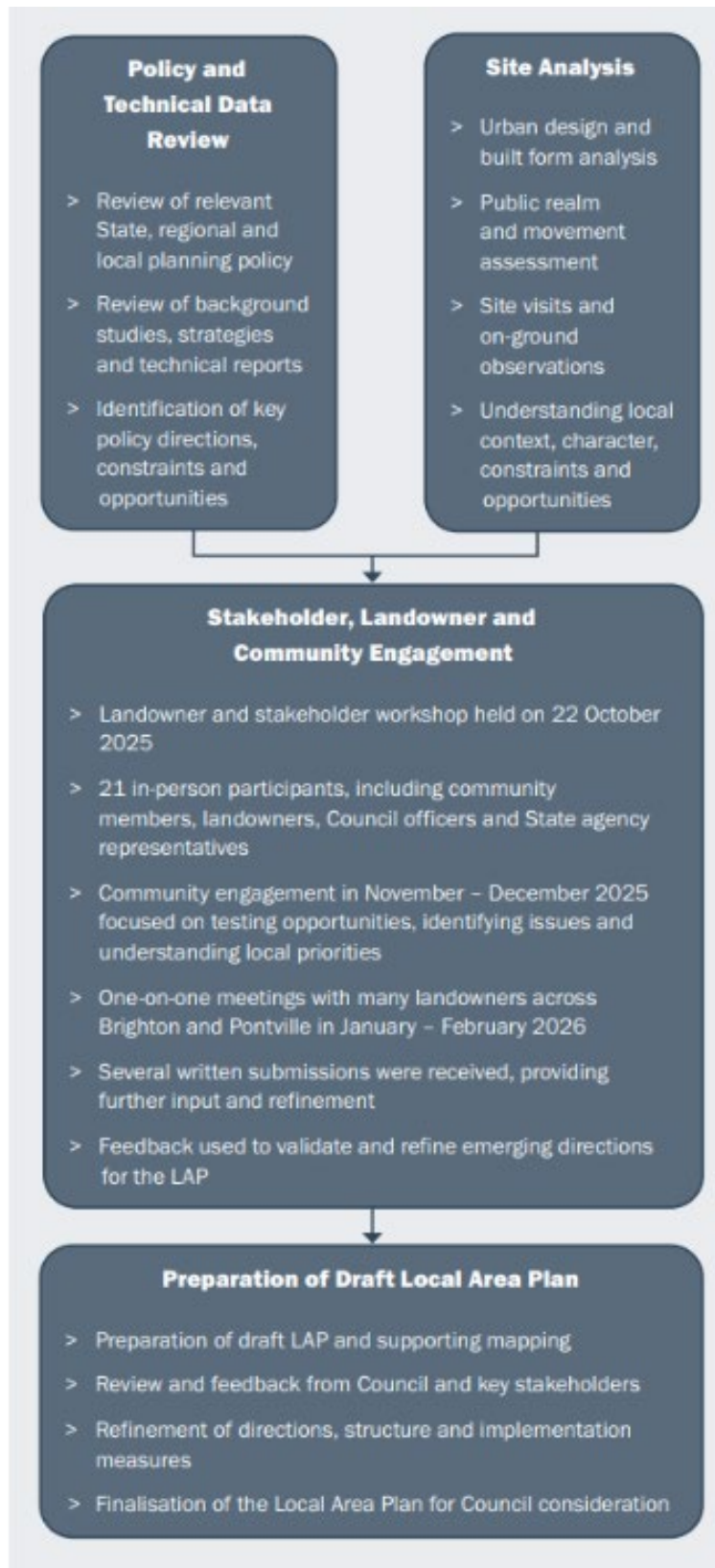
Figure 1 BLAP Methodology (Mesh)