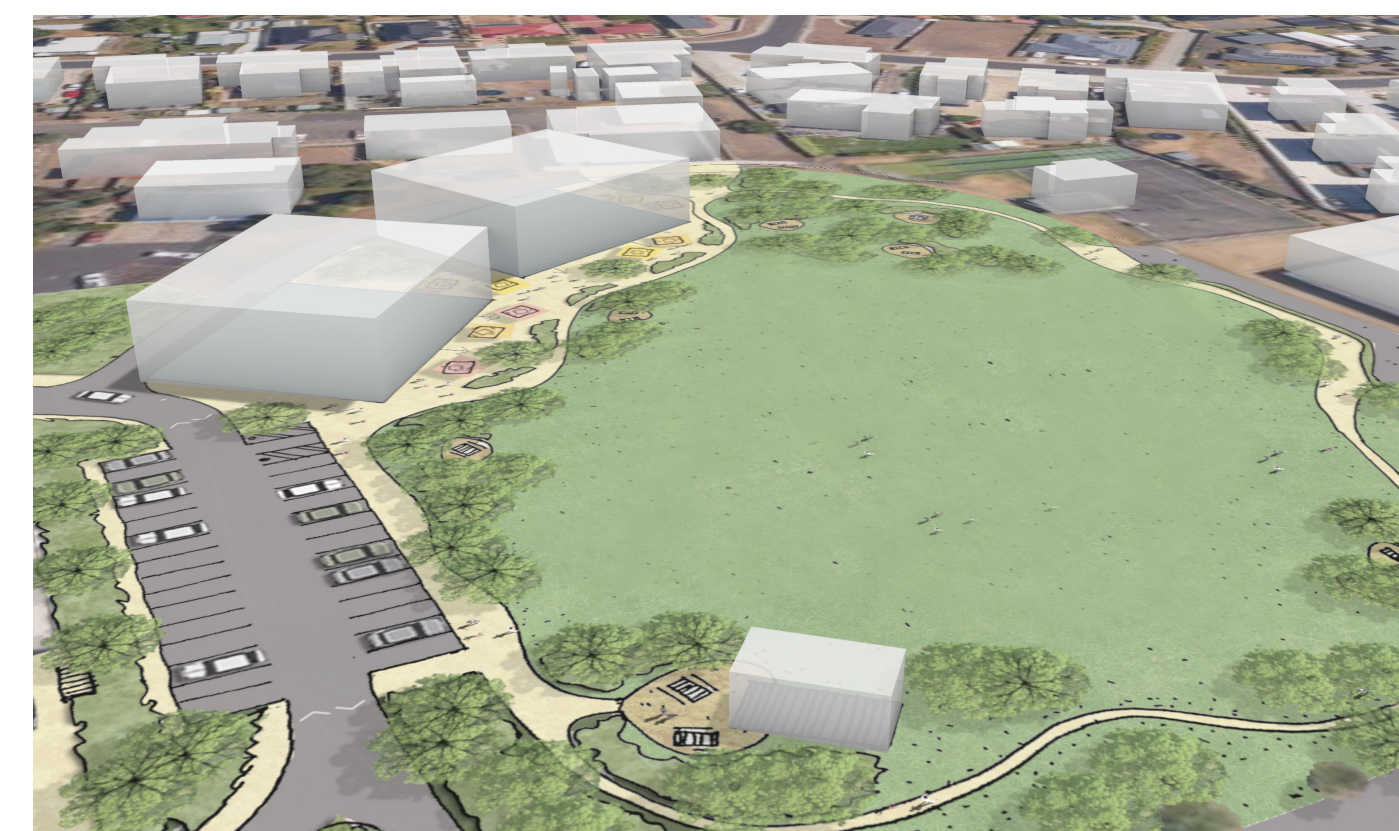
MASSING MODEL - VIEW 2