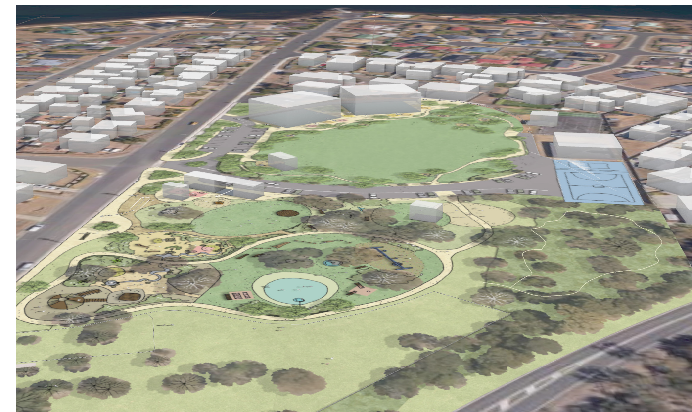
MASSING MODEL - VIEW 1