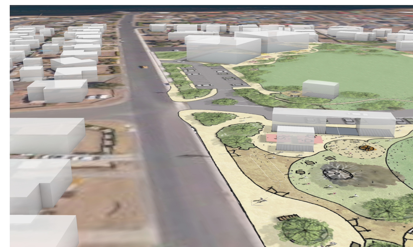
MASSING MODEL - VIEW 3