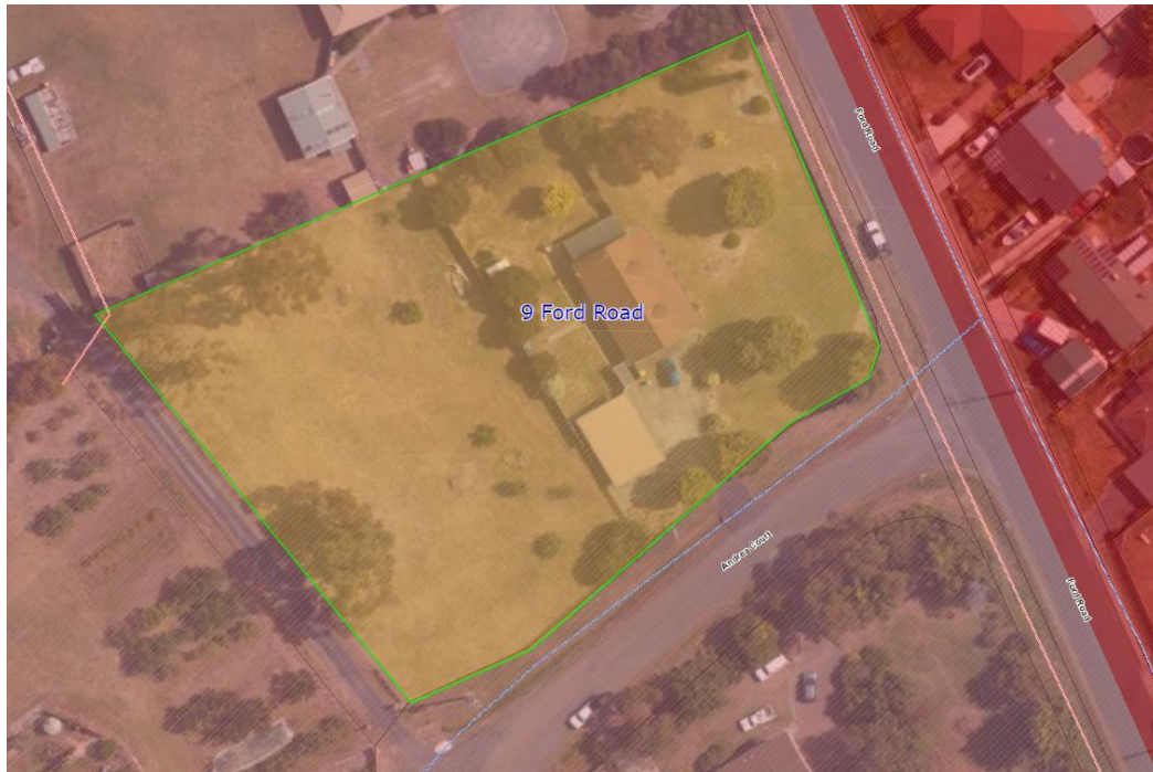
Figure 1. An aerial image of the site and its immediate surrounds

The site area is calculated to be 5193m 2 .