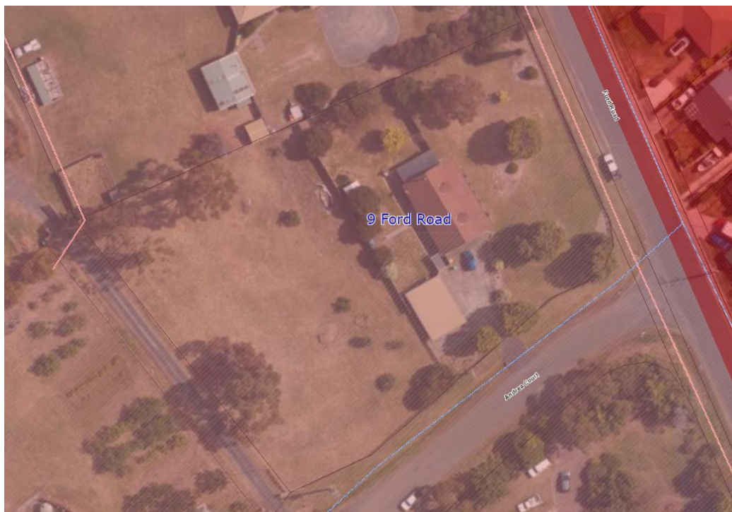
Figure 2. Zoning (Low Density Residential Zone highlighted in pink)

The site and adjoining land are zoned Low Density Residential (see Figure 2).