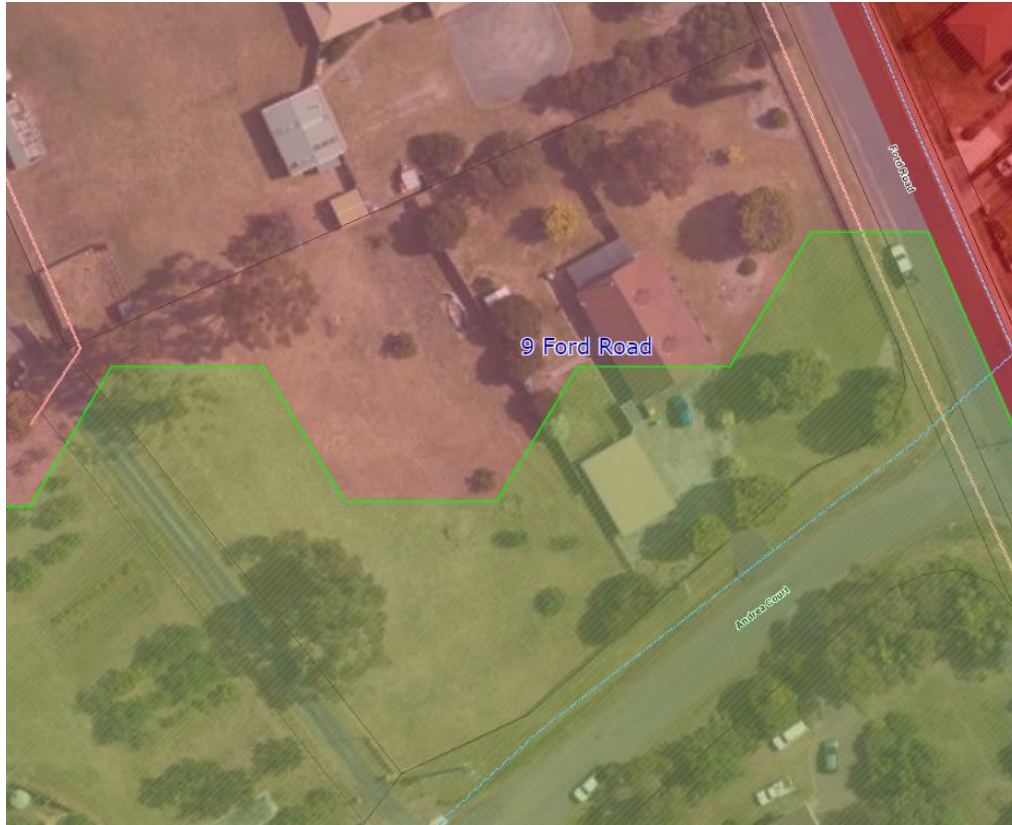
Figure 3. Priority Vegetation Area highlighted in green