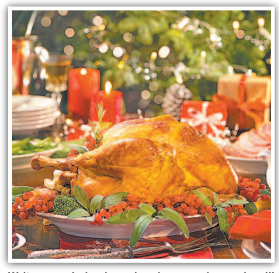
Write a meal plan based on how much people will actually eat, don't over-buy ingredients you can't use in another meal

wraps or large, reusable silicon covers instead of singleuse plastic wrap. Some silicon