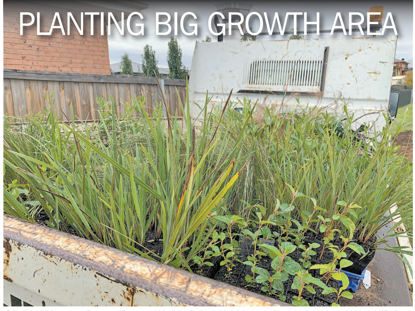
Planting will focus on climate resilience and biodiversity in residential areas, places of commerce and high traffic flow.

Council Facebook page. We're excited by the opportunities and look forward to sharing the first edition of Brighton Community News in February.