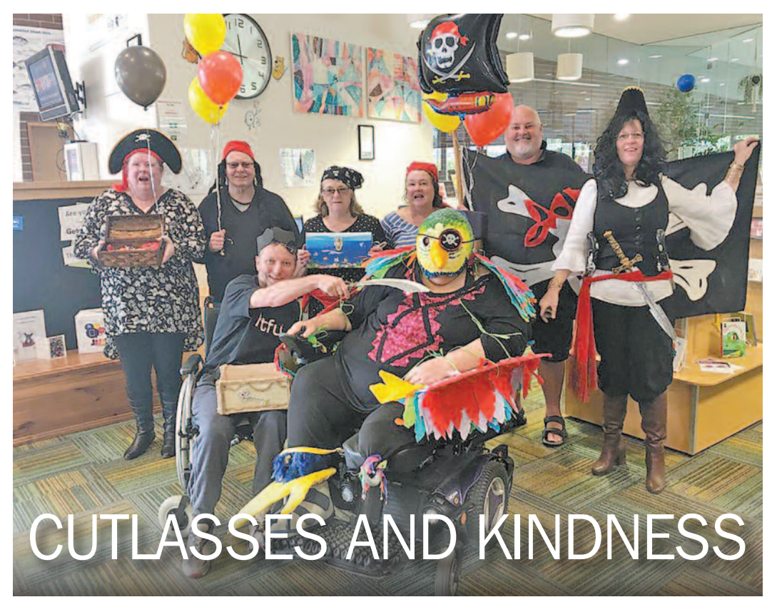
Our highlight again this year was Talk Like a Pirate Day when we dress up as pirates and wander the Greenpoint Plaza area giving away chocolates

For more information see: www.brighton.tas. gov.au/property/waste/ or phone (03) 6268 7000