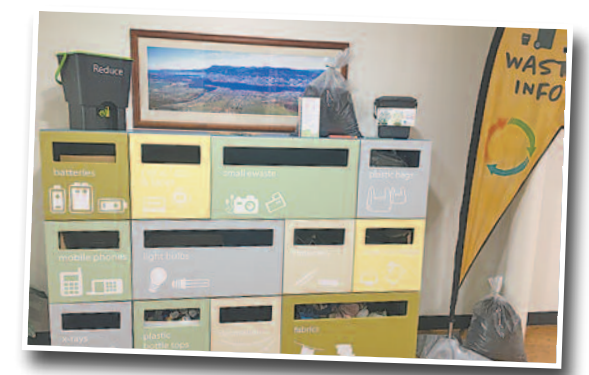
The recycling waste booth at the Brighton Council Offices.

The full list of items that you can bring in to be recycled in the waste booth include: X-rays, which contain precious silver; Toner cartridges; Light bulbs – LED round globes as well as fluoro globes, though please be careful not to break them and release the gases; Batteries – flat batteries can be used to make more batteries; DVDs/CDs and tapes; Small e-waste, which contain valuable metals; Decorations –