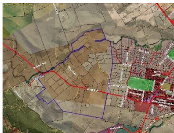
Figure 2: The West Brighton SAP area shown by the blue border.