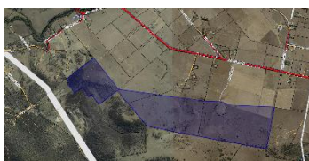
Figure 3. Land at 177, 252, 297, 299 Elderslie Road & 610 Millvale Road

5.1 Four representations were received, each raising the issue of rezoning the southern portion of 177, 252, 297, 299 Elderslie Road & 610 Millvale Road from Rural Resource to Significant Agriculture. This land is depicted in Figure 3, below: