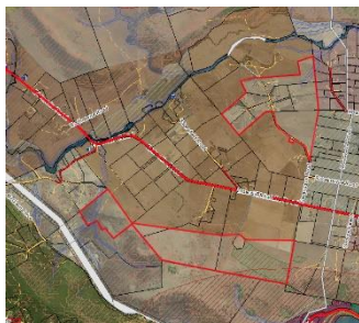
Figure 1: Areas proposed to be rezoned from Rural Resource to Significant Agriculture shown by red border.