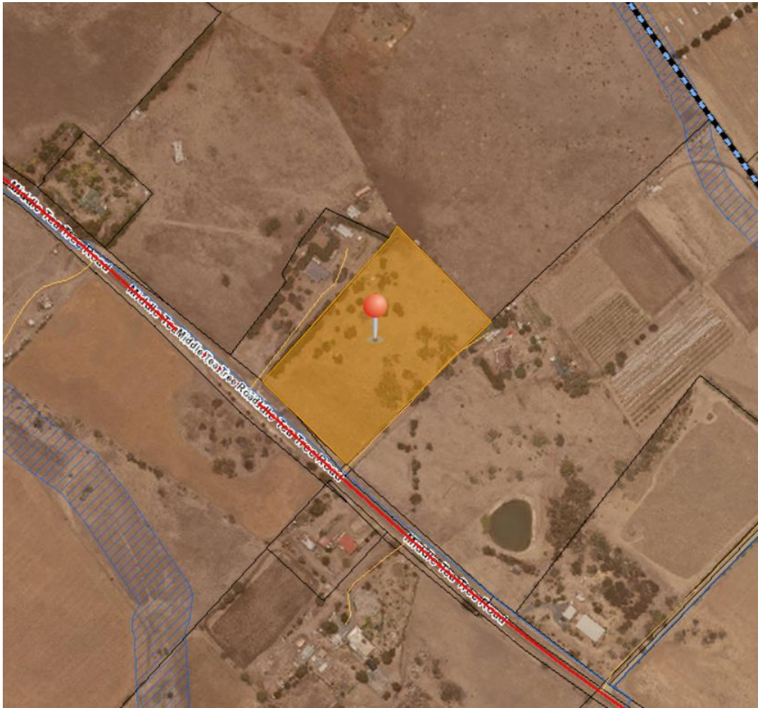
Figure 2. Zoning of the subject site and surrounds. Dark brown denotes the Significant Agricultural Zone.