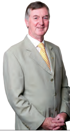
TONY FOSTER OAM JP MAYOR OF BRIGHTON