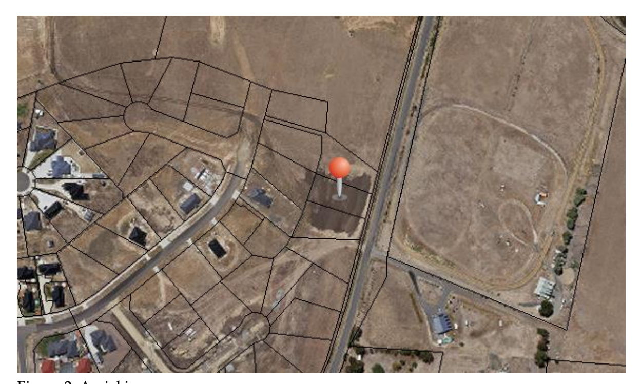
Figure 2. Aerial image