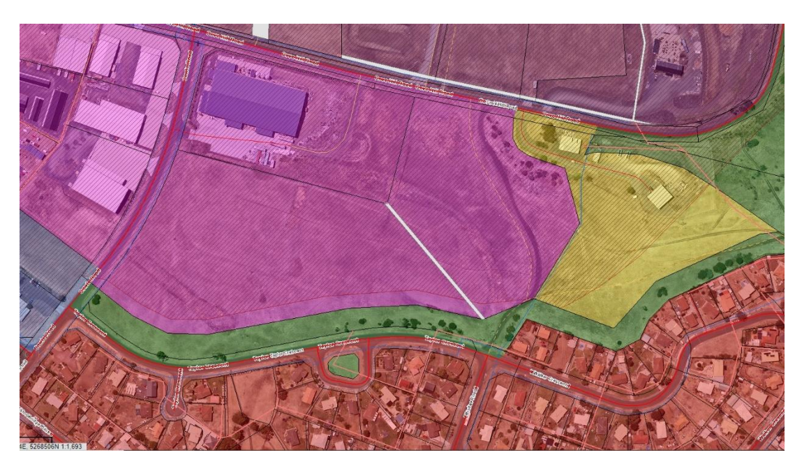
Figure 1: Zoning map of the subject area.