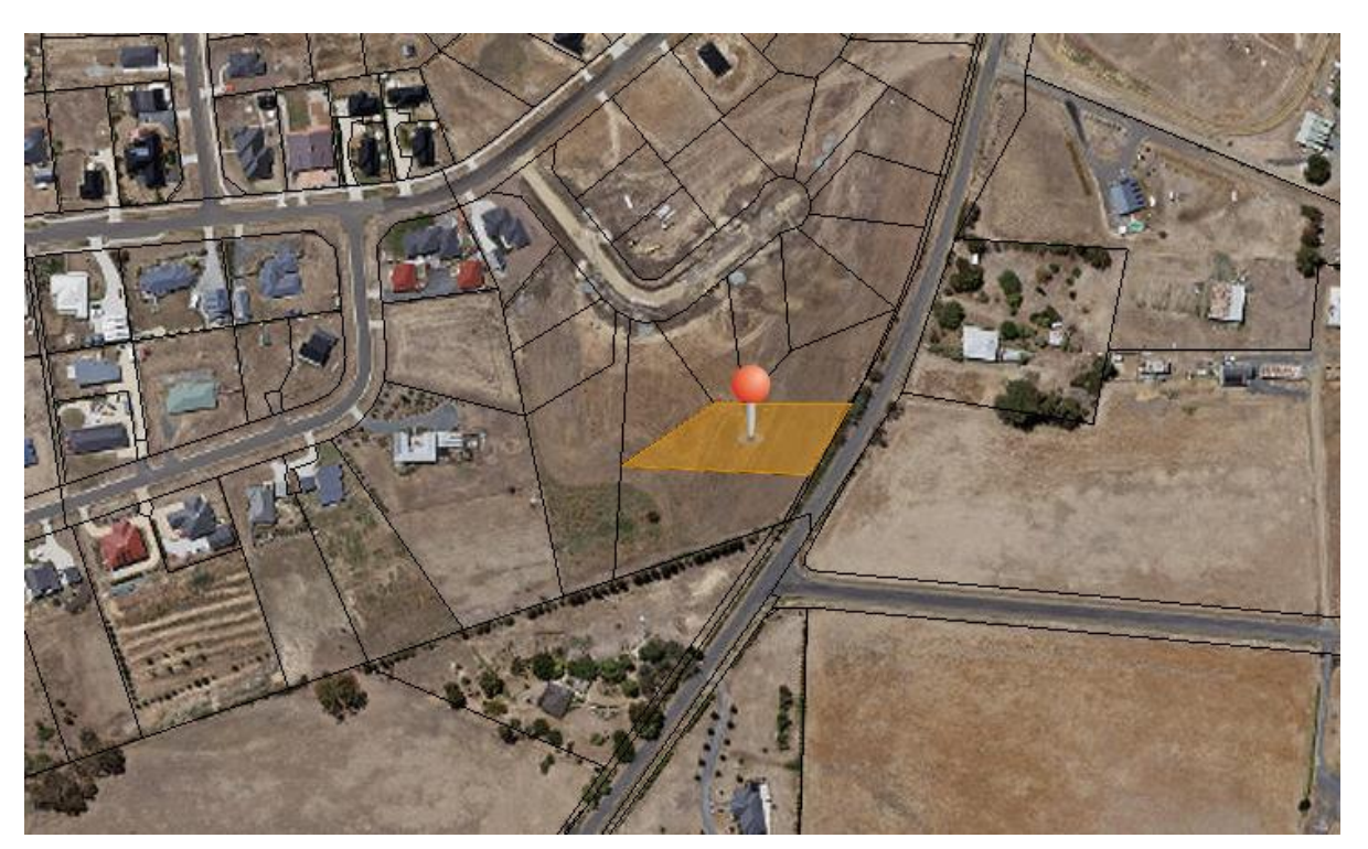
Figure 2. Aerial image