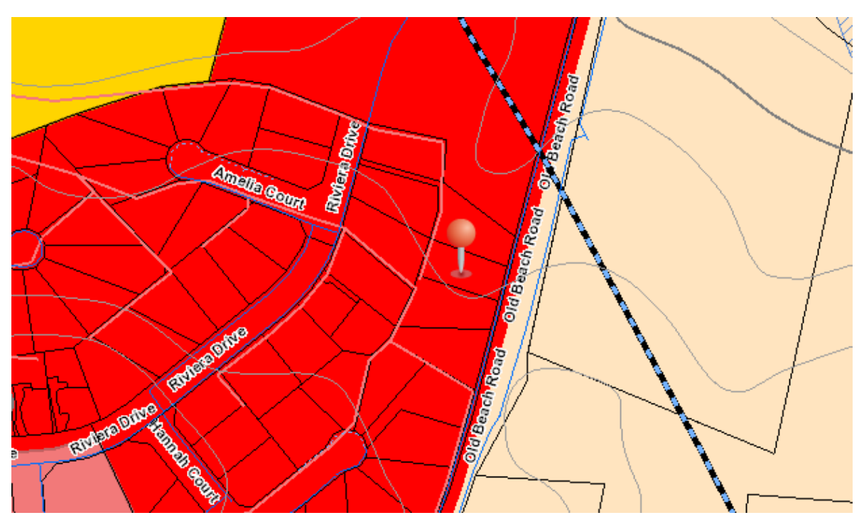
Figure 1. Zoning: General Residential (Chilli Red), Deep Pink (Low Density Residential), Yellow (Urban Growth Zone) and Tan (Rural Resource)